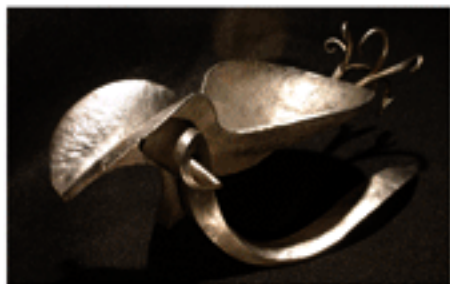
Cambrian Bowl 2, Steel