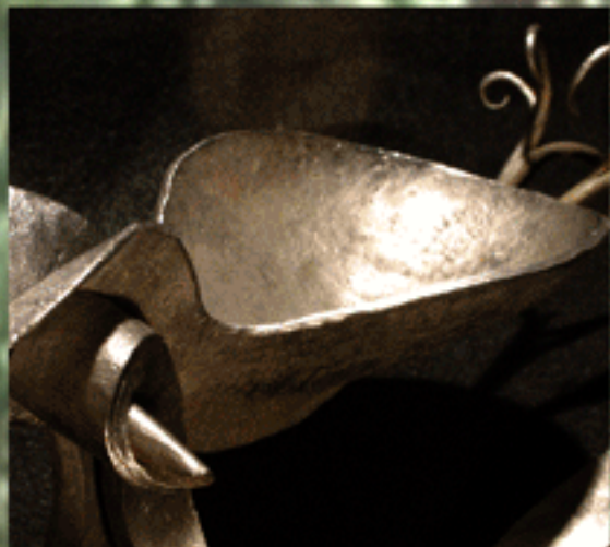
Will Slagel, Metal Meanders, Steel Sculpture