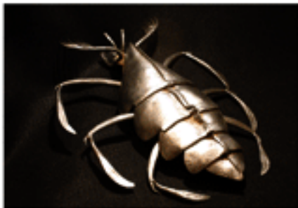
Cambrian Sea Creature, Steel