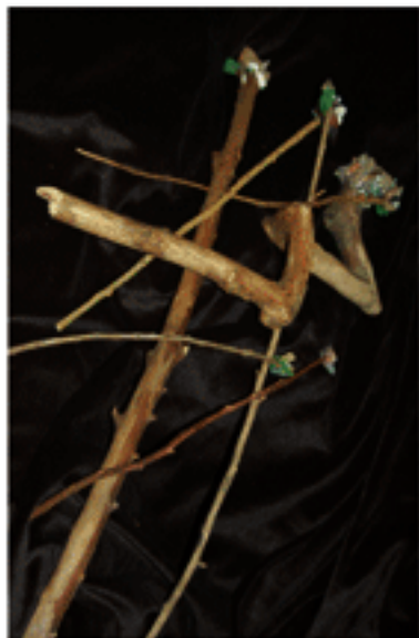
Water Wands Seashell, Glass, rose & hawthorne woods

Now writing for Chicago at the Examiner.com