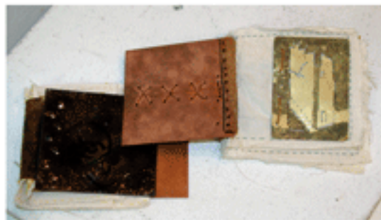
Print Plate Books, Brass, Copper, linen, sinew

Shaping space utilizing relief etched brass plates for mono prints and metal sculpture. These works reinterpret the functions of the print and printing plate, while maintaining the democratic nature of the multiple. Inviting the viewer to explore symbolic variation and the context of ritual across global cultures, these metal and found material sculptures thwart rigid categories and move fluidly from ancient to modern imagery and mediums. These Sculptures are textural and invite touch, while maintaining a visually intriguing symbolism and color palette.