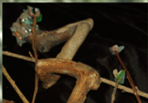
J. Lynn Kronika, Mixed Media

Please enter at side gate through Bamboo Garden