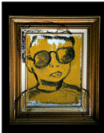
Me, Found Frame & Paint