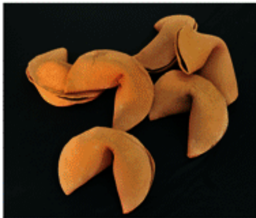
Fortune Cookies, Ceramic

Stripping down the real in each of us, the sculptures I create are left naked.