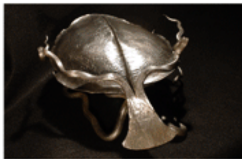
Cambrian Bowl 3, Steel