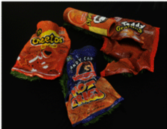
Junk Food, Ceramic