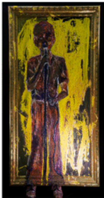
Man Singing, Found Frame & Paint

Left with only your imagination, preconceived associations and my words to you.