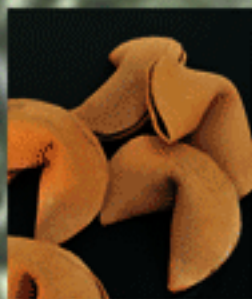
(Eve) Chulee Choowong-In Ceramic and Painting